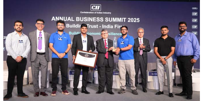
Sharify Services Private Limited (Gurgaon, Haryana)