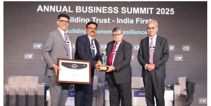
Tamboli Castings Limited (Bhavnagar Plant, Gujarat)