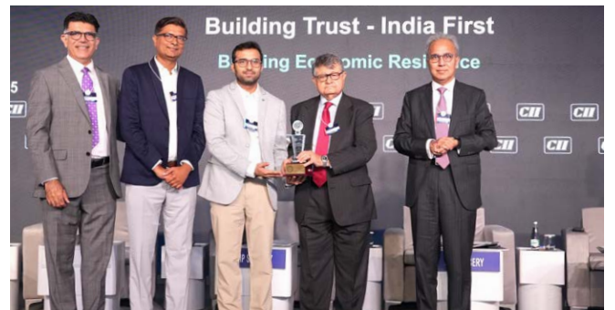
Fronius India Private Limited (Pune Plant, Maharashtra)