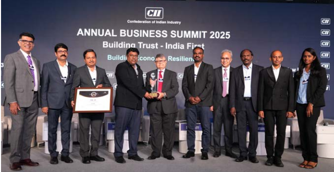
TVS Motor Company Limited (Haritha Plant, Hosur, Tamil Nadu)