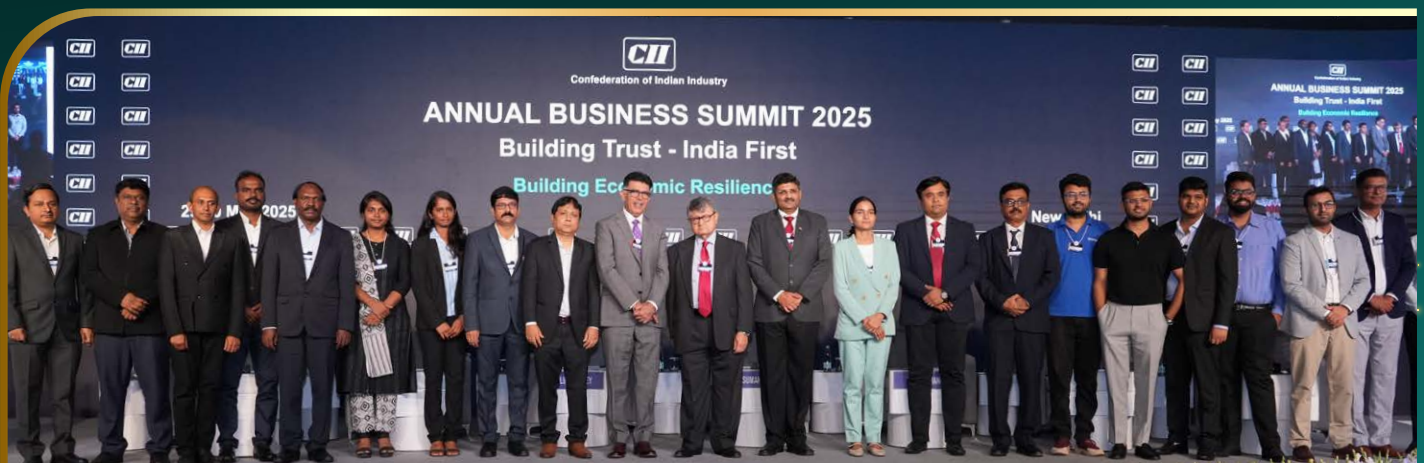
Winners of the Inaugural Edition of the Awards, New Delhi, 2025