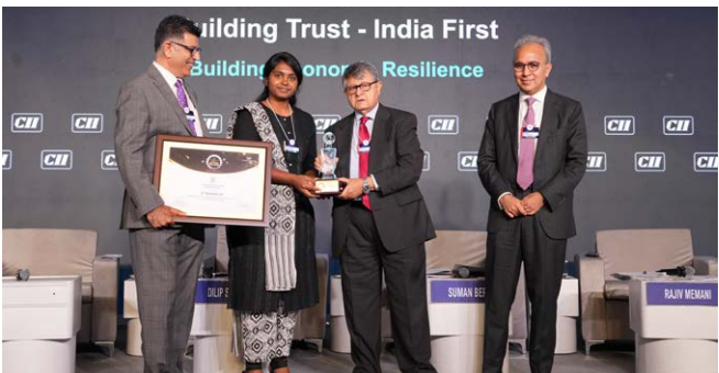
Hindustan Unilever Limited (Pondicherry Factory)