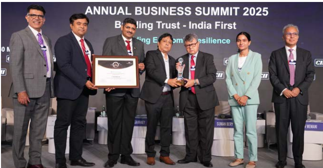
Larsen and Toubro Limited - Heavy Engineering Division (Surat Plant, Gujarat)